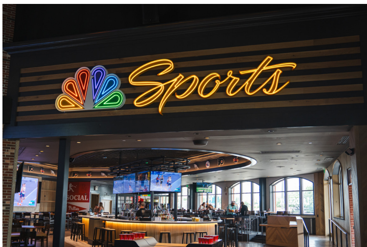
NBC Sports Arena Saturday Night Reception