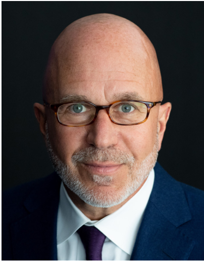
MICHAEL SMERCONISH Host of The Michael Smerconish Program on SiriusXM, Host of CNN's Smerconish and Contributor

7:00 am - 5:00 pm 7:30 am - 4:00 pm 7:30 am - 9:00 am 9:00 am - 12:30 pm 12:30 pm - 2:00 pm 2:30 pm - 4:00 pm 4:15 pm - 5:00 pm 6:30 pm - 8:30 pm Conference Registration Urban Schools Resource Room/Internet Cafe General Session C: Breakfast and Speaker: MICHAEL SMERCONISH CONCURRENT SESSIONS ON BEST PRACTICES General Session D: Lunch and Speaker: ANA NAVARRO General Session E: Town Hall Meeting Great City Colleges of Education General Meeting Reception at National Constitution Center