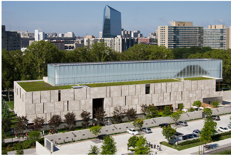
Barnes Foundation Wednesday Welcome Reception