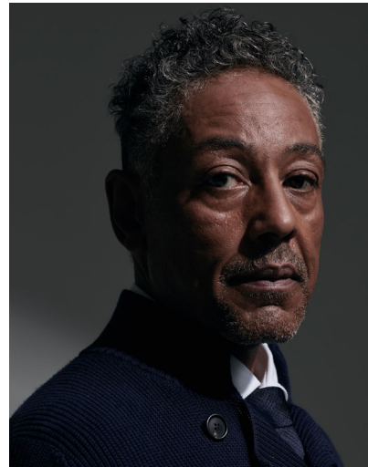
GIANCARLO ESPOSITO Award-Winning Actor and Director; Arts & Education Advocate