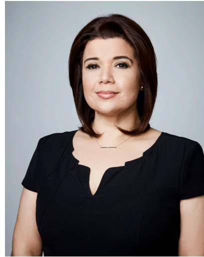
ANA NAVARRO GOP Strategist and Political Contributor to CNN, Telemundo; Co-Host of ABC's The View

8:00 am - 9:30 am 8:30 am - 12:00 pm 12:30 pm - 2:30 pm 6:00 pm - 8:00 pm General Session F: Breakfast Board of Directors Meeting Fall Conference Debriefing and Planning Lunch Meeting with Boston Public Schools Farewell Party at NBC Sports Arena