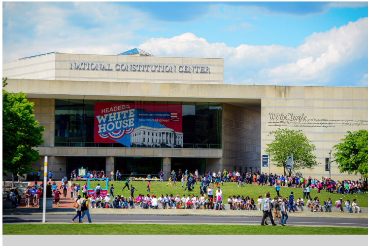
National Constitution Center Friday Night Reception